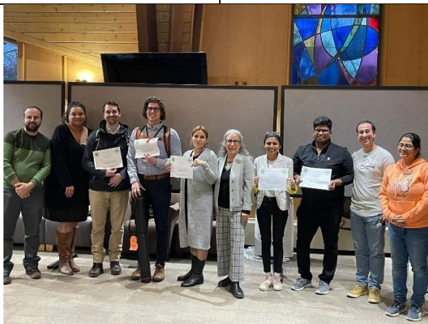
GSA Research Conference (Dec. 14, 2023)