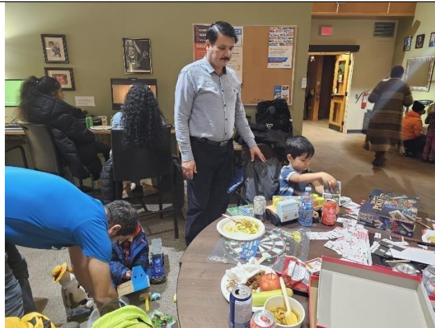
GSA/ISSAC/Wellness Holiday Hangout (Dec. 27 and 28, 2023)