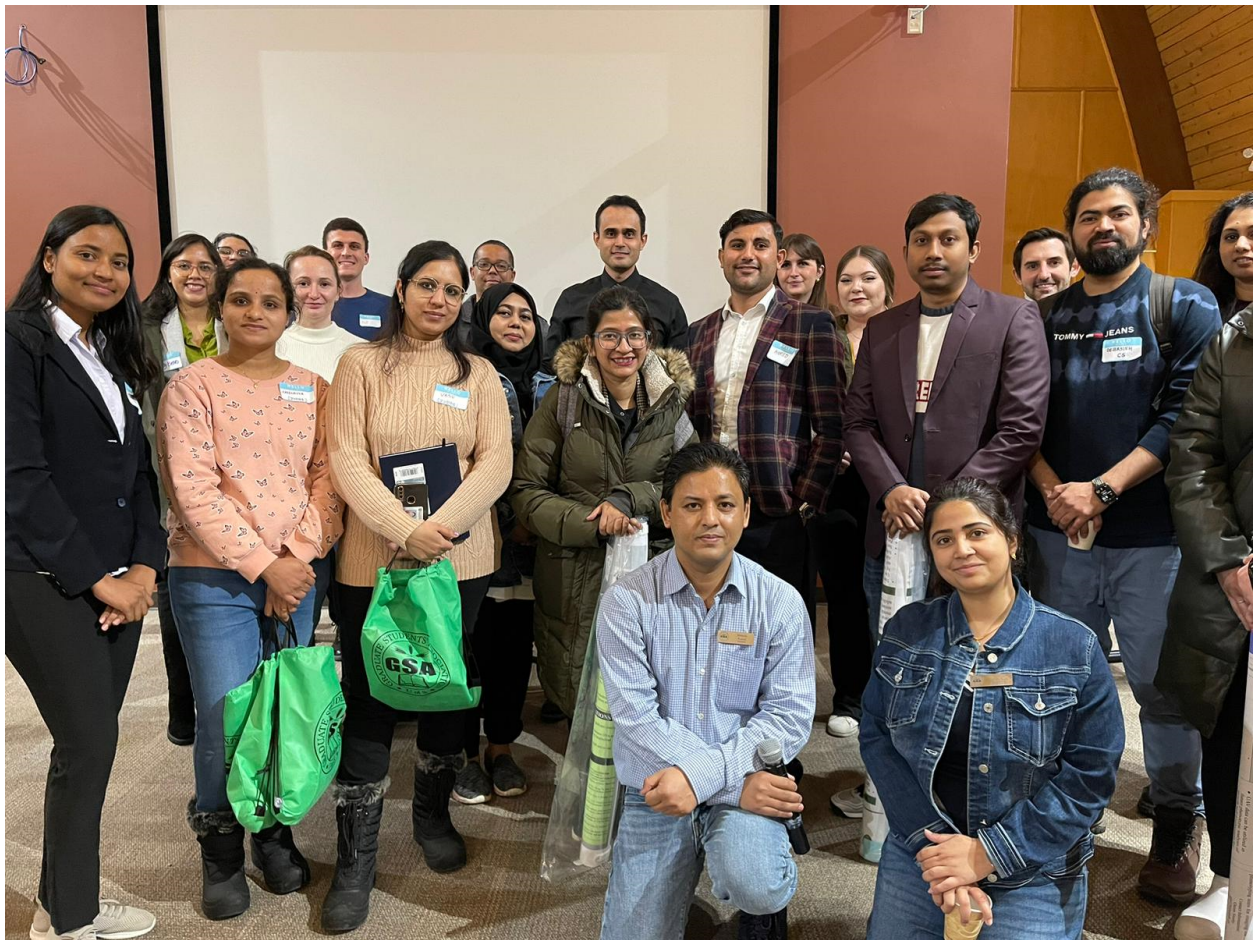
Picture 2: Graduate Research Conference 2023 post-presentation group picture

number of graduate students participated in the graduate research conference's recorded history. All submitted posters were accepted for presentation. GSA provides a poster stand at the GSA commons on the conference day for poster display. The posters were evaluated by ten postdoctoral fellows using a rubric. Two judges evaluated each poster to minimize unconcise bias during the evaluation process. Four students are selected for the best poster award. Prizes are valued at $500 each. The four winning poster candidates will receive $500 each as prize money. The GSA is grateful to the College of Graduate and Postdoctoral Studies (CGPS) for its financial support for the Graduate Research Conference 2023.