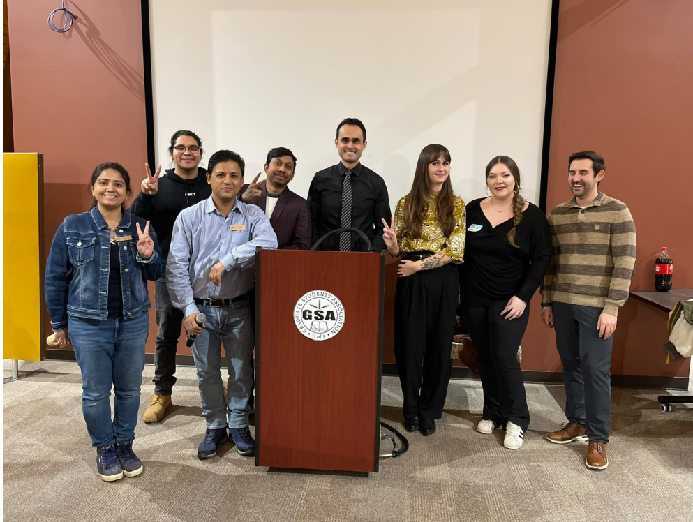
Picture 6: The GSA executives and the four winning poster presenters.