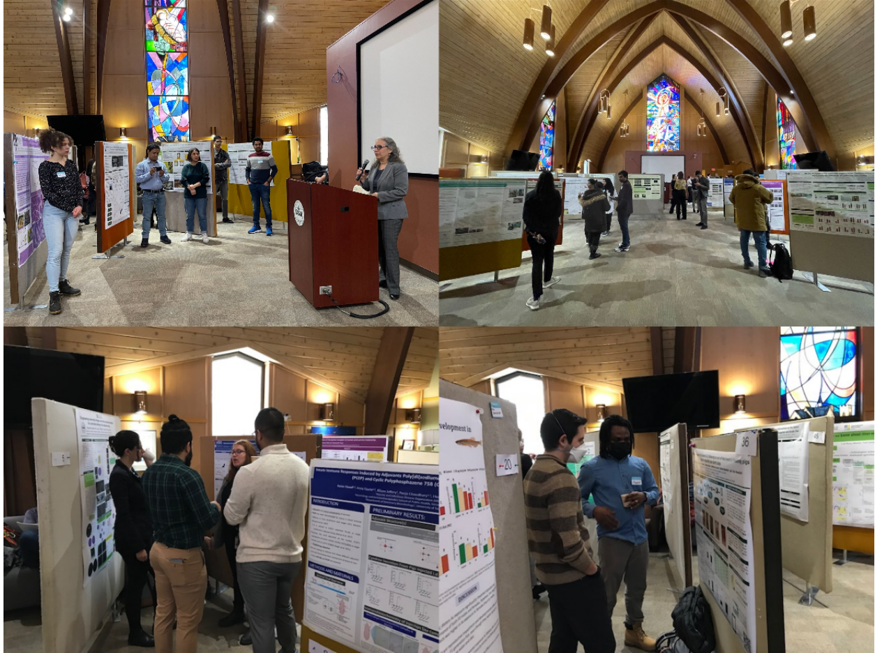
Picture 3: Different moments of the Graduate Research Conference 2023