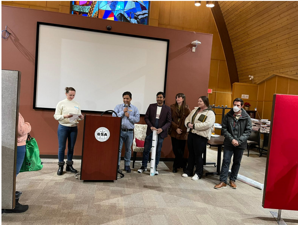
Picture 5: Different moments of the Graduate Research Conference 2023, Poster Judge announcing four winning poster presenters' names.